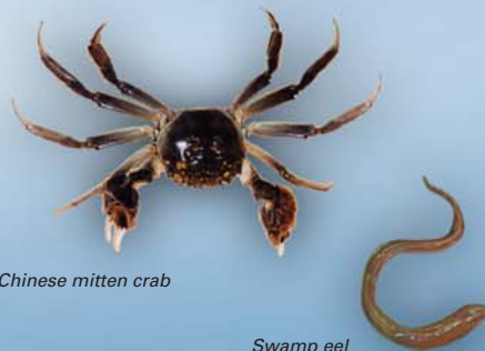
Chinese mitten crab